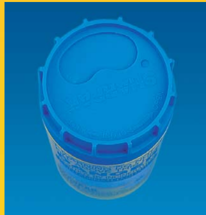
1ST POSITION 'HALF OPEN'