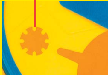
Insulin Pen Needle removing Feature